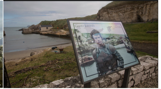
Games of Thrones (HBO, Ireland)