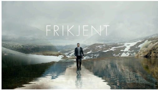
Frikjent/Acquitted (Tv2, MisoFilm Norway, N)