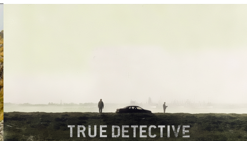
True Detective (HBO, Louisiana, US)