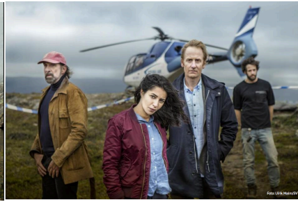
Midnatssol/Midnight Sun (Svt, NiceDrama, Canal+)