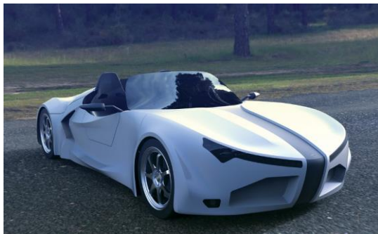
Fig1.1 Rendered model of hydrogen hybrid car.

In this talk our experiences with scaling up the hydrogen storage tank for hydrogen hybrid car (fig. 1) will be presented. Heat management issues (fig. 2), structural materials issues, safety issues, particles filtering issues will be shown and discussed more in detail.