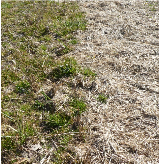
Straw removal vs. 12 Mg straw ha -1 (Photo: Johannes L. Jensen).