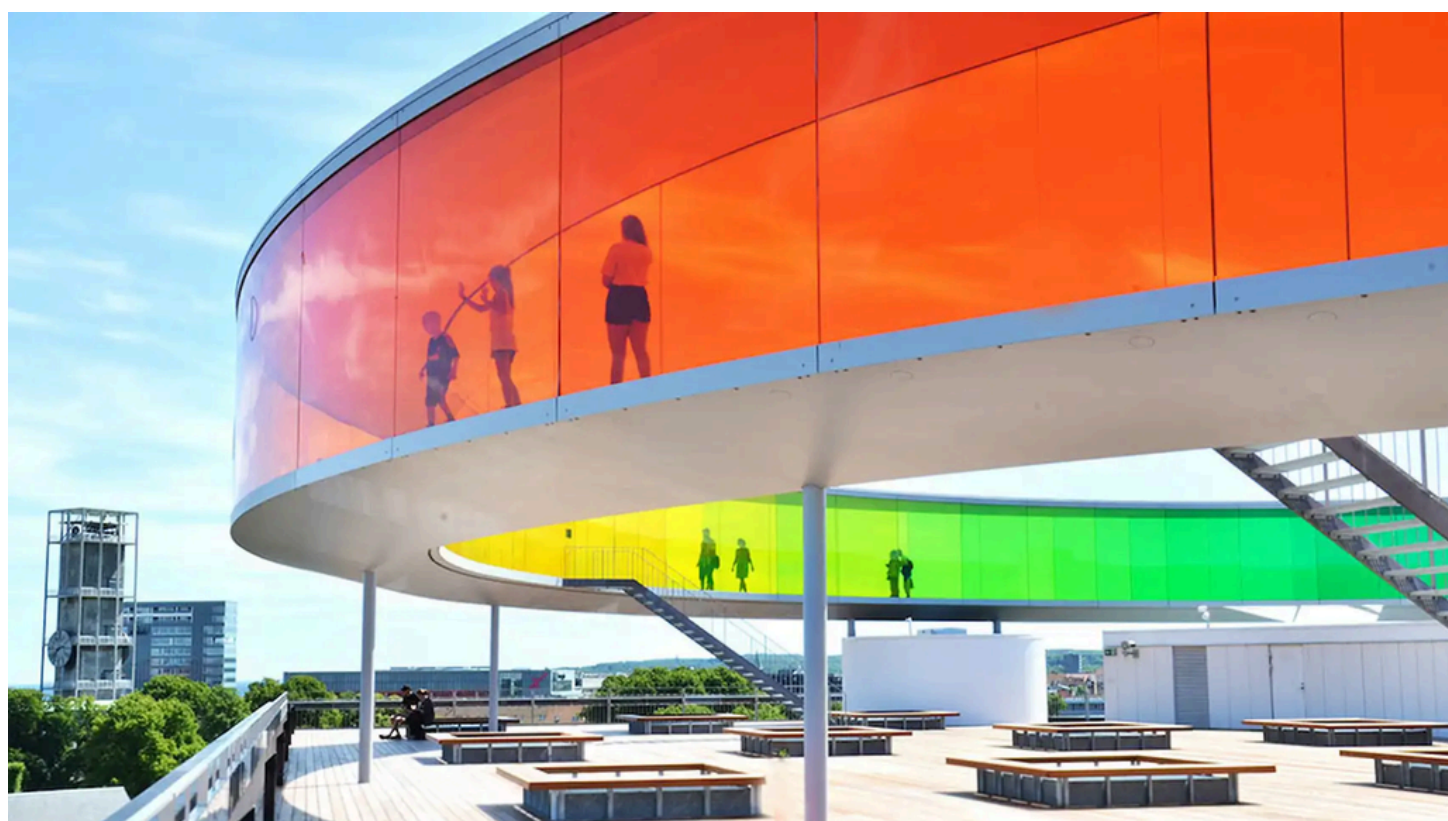
Photo: Your rainbow panorama, Olafur Eliasson, 2006 - 2011, ARoS Aarhus Art Museum.