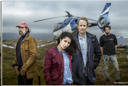
Midnatssol/Midnight Sun (Svt, NiceDrama, Canal+)