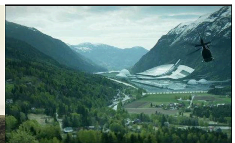
Okkupert/Occupied (TV2 Norway, YellowBird)