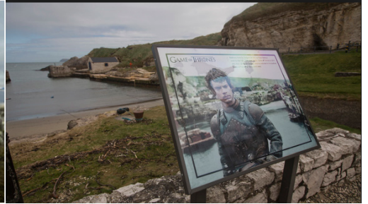
Games of Thrones (HBO, Ireland)